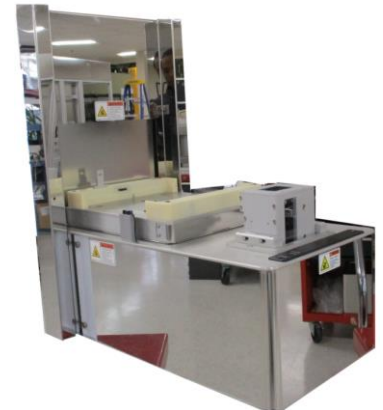
PLM EUV DUAL WITH OHT GUIDE KIT INSTALLED